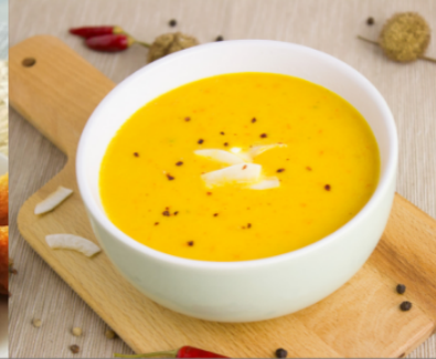
Grilled Pumpkin Soup