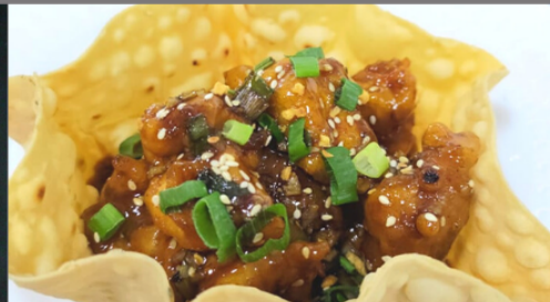
Sticky Sauce Cauliflower