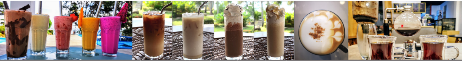
Fruit Shakes & Smoothies