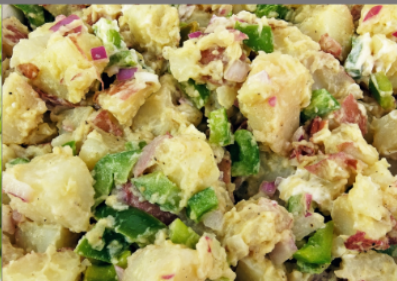
Creamy Potato Salad