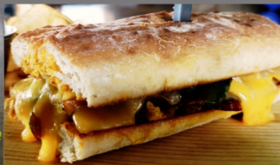
Fili Bistek Sandwich