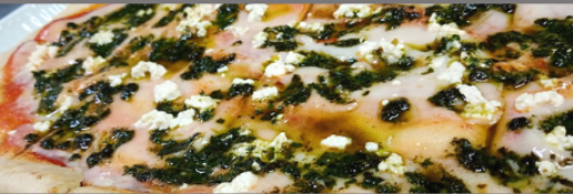
Vegan Pesto Pizza

Pomodoro Sauce, with own pizza cheese, parmesan and cheddar.