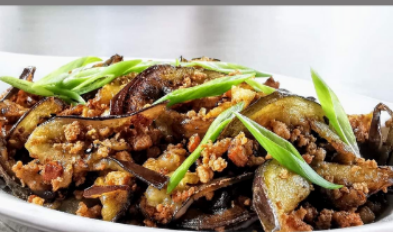
Stir Fry Eggplant

Crispy noodles and traditional Chinese vegetable medley in garlic and leeks.