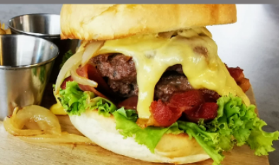
Bacon Cheese Burger