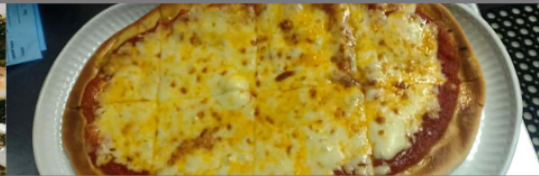
Triple Cheese Pizza