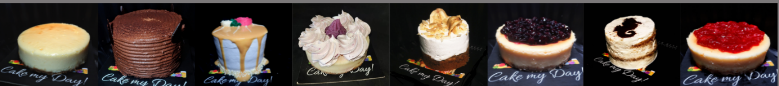
New York Cheesecake