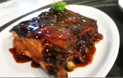
Smoked BBQ Pork Ribs