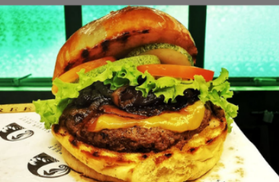
Vegetarian Based Build Burger

pomodoro, aioli, gooey melted mozzarella cheese with a side of house potato wedges