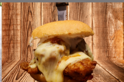
Crispy Chicken Parm Sandwich