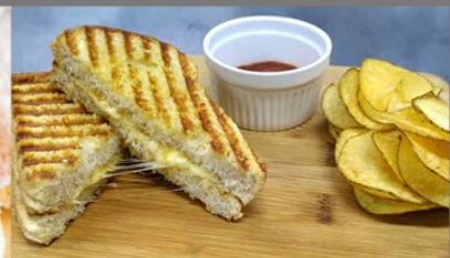
Grilled Cheese Sandwich