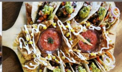
10 Taco Highway