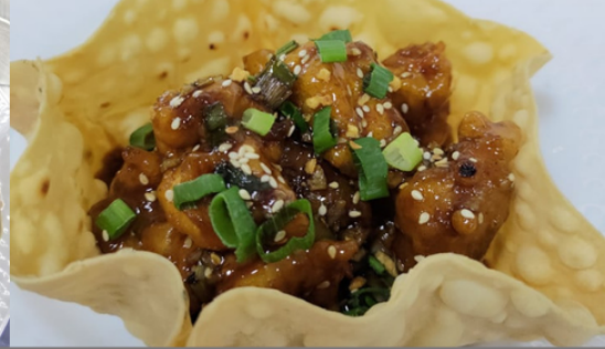
Chicken Sticky Sauce