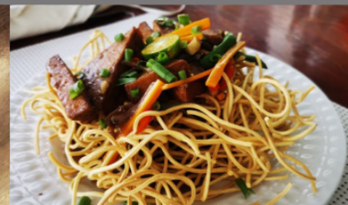
Vegan Crispy Fried Noodles