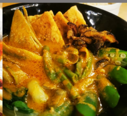
Vegetable Kare Kare