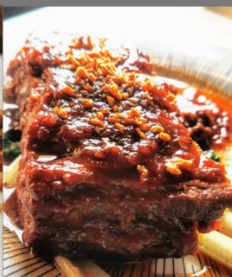
Honey Glazed Ribs