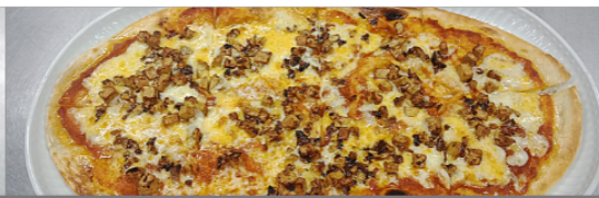
Mang-Wood Smoked Bacon Pizza