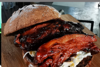
Ribs on Rye